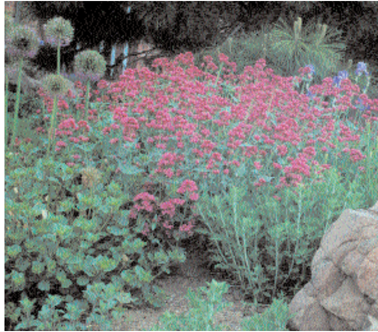
Red Valerian (Centranthus ruber)

To further reduce your water consumption, consider using alternative sources of irrigation water, such as gray water, reclaimed water, and collected rainwater. According to the AWWA Research Foundation, homes with access to alternative sources of irrigation reduce their water bills by as much as 25 percent. 4 Graywater is untreated household waste water from bathroom sinks, showers, bathtubs, and clothes washing machines. Graywater systems pipe this used water to a storage tank for later outdoor watering use. State and local graywater laws and policies vary, so you should investigate what qualifies as gray water and if any limitations or restrictions apply. Reclaimed water is waste water that has been treated to levels suitable for nonpotable uses. Check with local water officials to determine if it is available in your area. Collected rainwater is rainwater collected in cisterns, barrels, or storage tanks. Commercial rooftop collection systems are available, but simply diverting your downspout into a covered