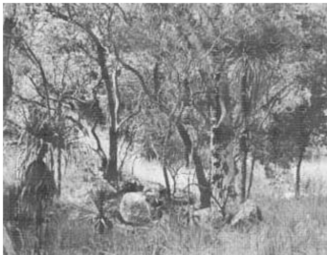
The natural beauty of Magnetic Island brings many visitors to the Townville region.

Ensure that facilities are used efficiently, neither wasted through under-use nor degraded through overuse.