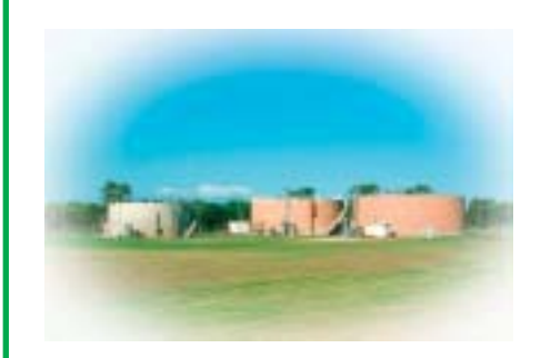
Sludge Digester Tanks

Because there is no air in it (anaerobic), the microbes use oxygen from other chemicals in the sludge such as sulphates, nitrates and phosphates, breaking down their composition. Sludge stays in the 2 Primary Digester Tanks for around 30-40 days, then is pumped to the Secondary Digester Tank for further digestion and dewatering.